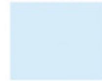
8U9 Silvery Blue Metallic