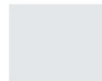
1G1 Hakunen Silver