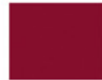
3R1 Morello Red