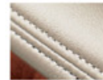
Ecru/Medium Brown Wood