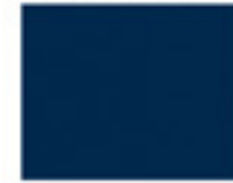
214 Black Opal *