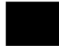
217 Starlight Black