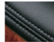
Black/Medium Brown Wood