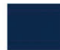
214 Black Opal *