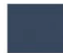
8V4 Shadow Sapphire