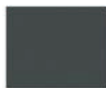
Mercury Grey 1H9