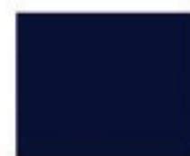
8V3 Lapis Lazuli