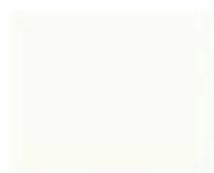
077 White Pearl