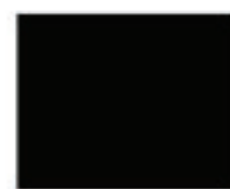
217 Starlight Black