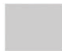
1G5 Frosty Pearl **