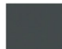
Mercury Grey 1H9