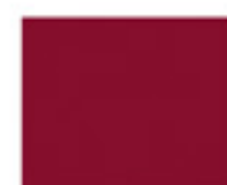
Morello Red 3R1