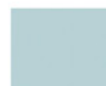
Silvery Blue 8U9*