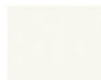
White Pearl 077